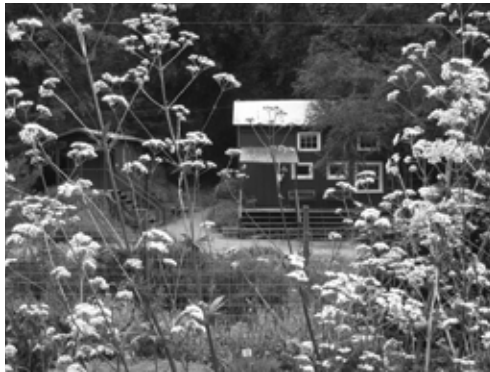
View of CSHS Classroom through the Blooming Valerian

If you are on our mailing list and would like to be removed, please call or email us. Feel free to pass this catalog on to a friend. Thanks!