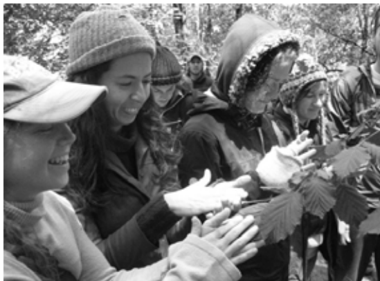
Hands On Learning