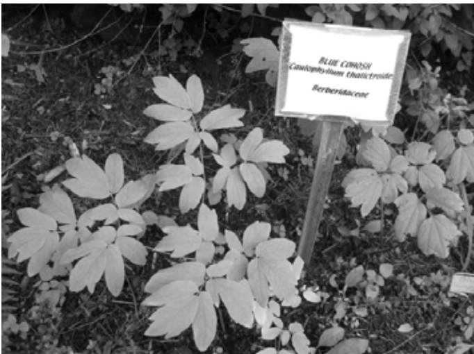
Blue Cohosh growing in the CSHS Garden

The fifth class will discuss Chinese Tongue Diagnosis. When we look at the tongue what qualities are we looking for? What does it mean? How will it change over time? How do we use it to help determine herbal treatments?