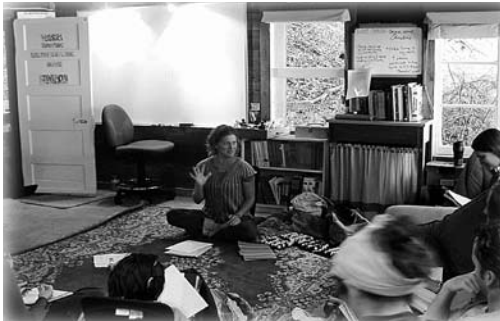
Aromatic Medicine Class in CSHS Classroom

This class fills in advance. Please register early.