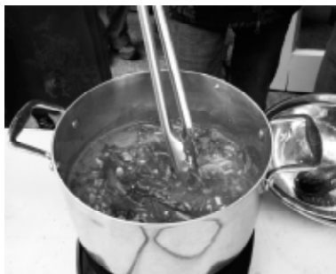
Making Pickled Nettles

Come join us in the vibrant springtime garden at CSHS! What is growing in the garden will guide each class as we focus on the medicinal plants that are ready to harvest and utilize this season. Our exploration will span from the medicinal to the magical, and the cultural to the culinary. Each session is a blend of lecture and hands-on time in the garden and lab. We will also discuss growing medicinal plants by cuttings and seed. This class is designed for the beginning student, though all levels are welcome.