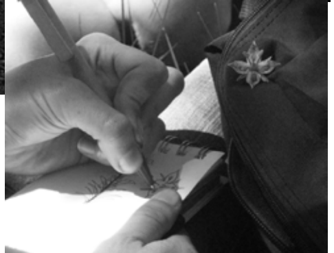
Photos Clockwise from Upper Left Corner Hawthorn Berries, Outdoor Class on Spring Camping Trip, Planting Seed in the Greenhouse, Sketching Swertia on the Sierra Camping Trip, Plant a Seed, Students at Annual Medicine Show